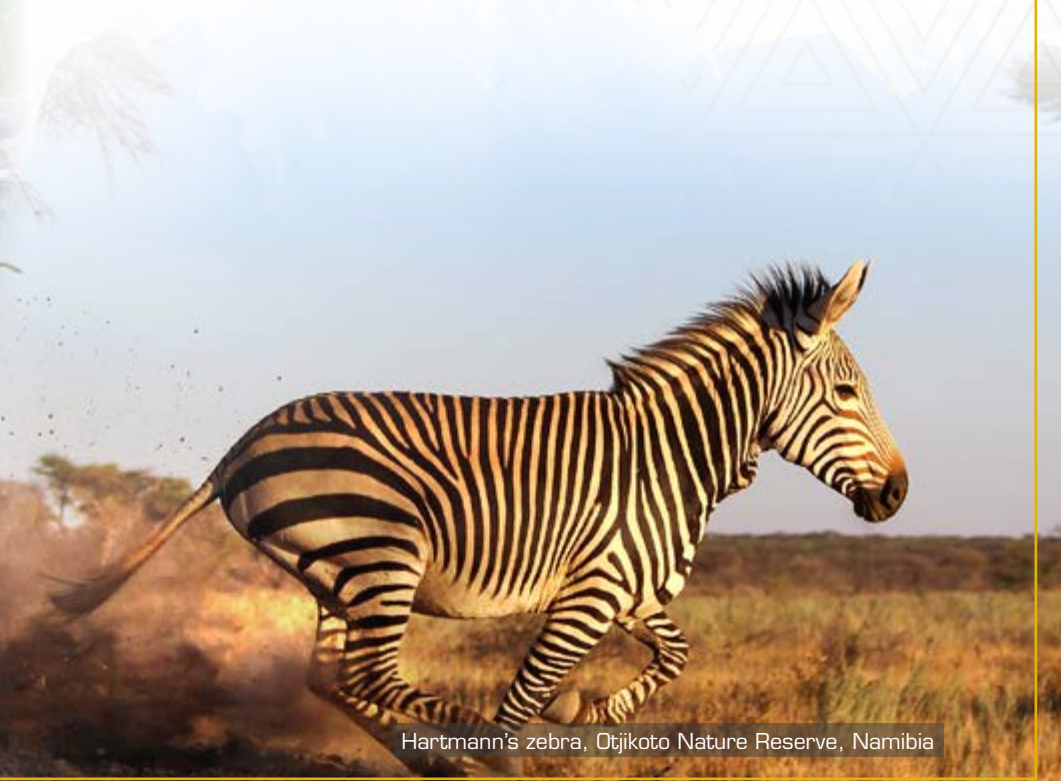
Hartmann's zebra, Otjikoto Nature Reserve, Namibia