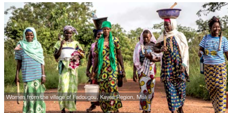
Women from the village of Fadougou, Kayes Region, Mali

Strengthening and promoting sustainable and alternative livelihoods is critical to the economic growth, prosperity and general well-being of the local communities – key projects include job creation, local business development, vocational training and skills for employment