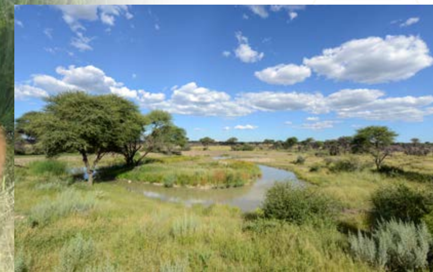
As a responsible miner, our CSR initiatives clearly demonstrate that mining can harmoniously coexist with, and enhance, environmental conservation

The NCE now has a membership comprised of 54 members, representing more than 90% of environmental NGOs in Namibia. This allows the NCE to draw best practice guidance from a pool of researchers, scientists and practitioners who are the best in the country. Several projects that are already underway include anti-poaching lobbying and support, research into sustainable housing and plans to develop an environmental best practice guide for the mining industry.