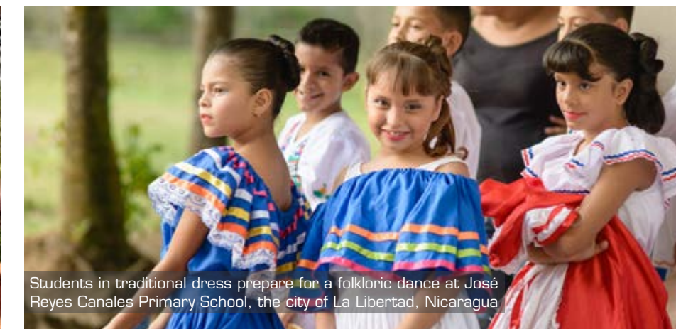
Students in traditional dress prepare for a folkloric dance at José Reyes Canales Primary School, the city of La Libertad, Nicaragua