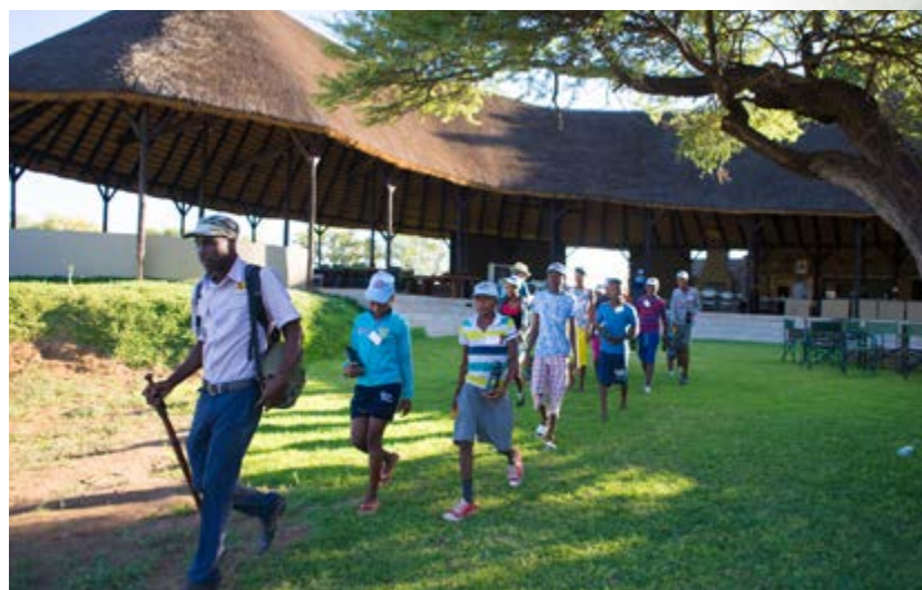
A class embarks on a bush walk at the Otjikoto Nature Reserve. In 2016, the B2Gold Education Centre hosted 1,089 students

The nature reserve also includes an extensive education centre where students can attend a wide variety of classes on environment, conservation, sustainable utilization of biological resources, recycling, responsible living and alternative energies – all of which are aligned with the Namibian government's school curriculum.