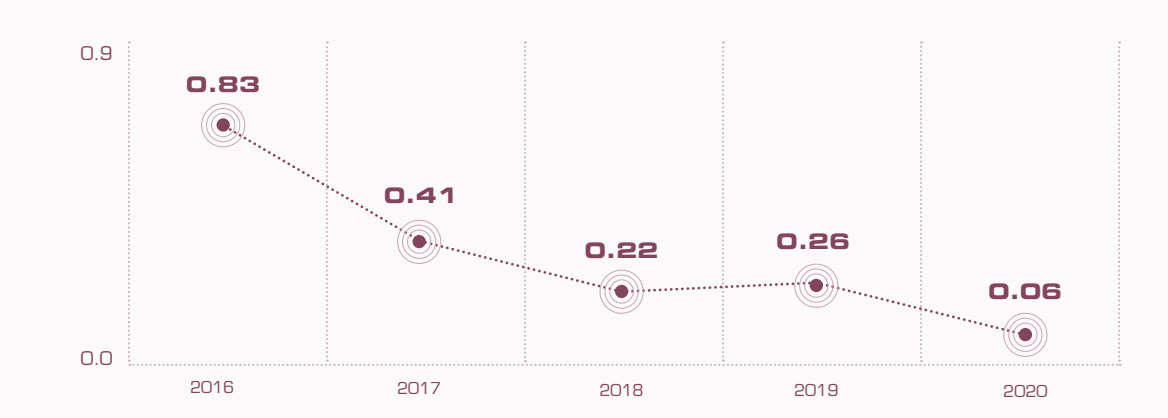
GRAPH 3 | B2Gold LTI Frequency Rate 2016 to 2020