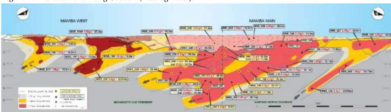
Figure 2. Mamba Zone Long Section (Facing West).

As a significant contributor to the combined mineral resources in the Anaconda Area, Mamba has been the subject of a focused campaign of infill drilling, with approximately 30% of the 17,992 m completed to date in 2023 being directed at resource class conversion within the oxide portions of Mamba. In addition, exploration for high grade sulphide mineralization continues to be an important part of the 2023 drilling program. Hole MSD_241 returned 8.60 g/t gold over 46.40 m, from 443.30 m (sulphide) and Hole BND_135 returned 5.87 g/t gold over 22.40 m, from 335.70 m (sulphide). These holes are consistent with previous intercepts in the high grade shoot below the March 2022 Mineral Resource pit boundary and will form the basis for follow up drilling later in 2023. Mineralization remains open along this shallow plunging zone.